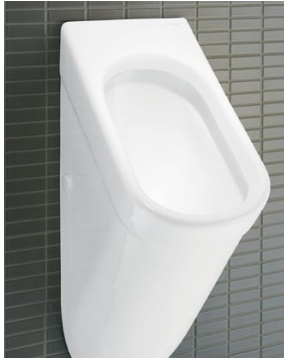
Caroma H20 Cube urinal